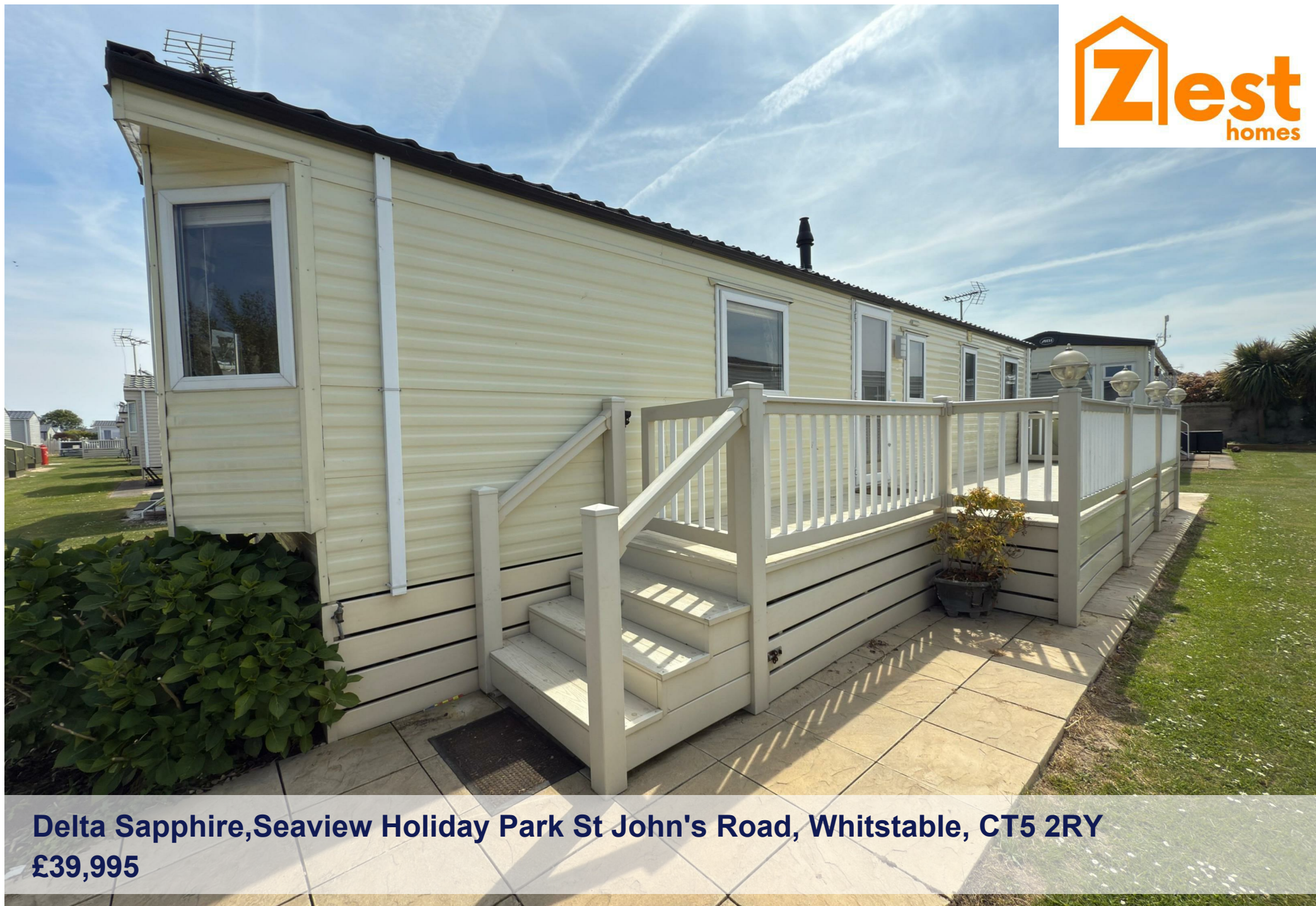
Delta Sapphire, Seaview Holiday Park St John's Road, Whitstable, CT5 2RY £39,995